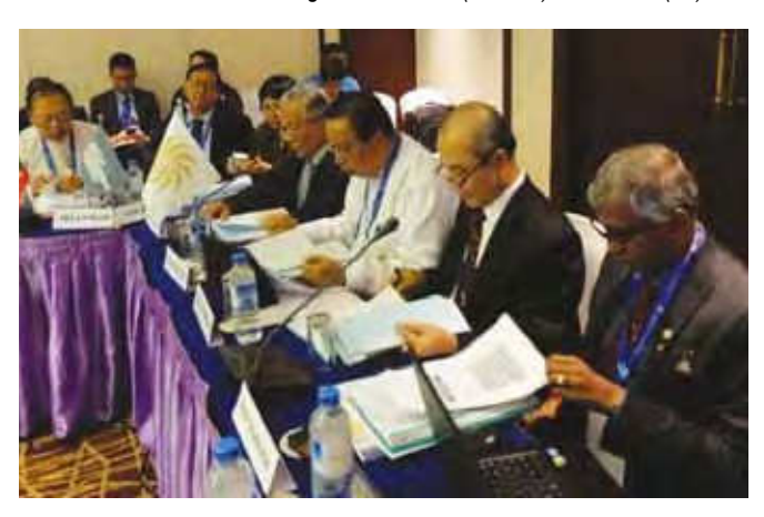
AFEO Board Meeting in session

and some delegates in the early morning. This was followed by the presentation of some technical papers. There were other activities in the afternoon as well on the day before the Conference proper.