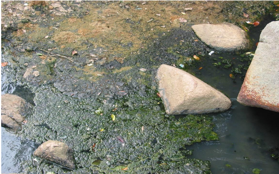
Algal sludge from restaurants and hotels covering beach water at a beach in Kuantan, Pahang

The Proposed Actions by Stakeholders Matrix in pages 8 & 9 explains the roles that various agencies will play in heading and implementing the action plans. Partnerships and cooperation with all stakeholders especially with the public are very important for the success of this initiative. Our beaches will regain their beauty for our people to enjoy and increase our revenue on tourism.