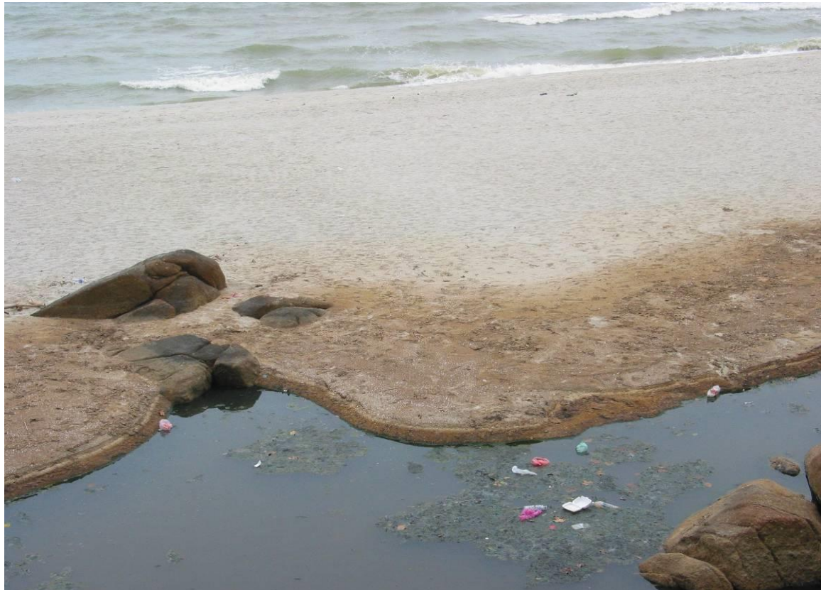
Rubbish strewn in the waters of a beach in Kuantan

We need our beaches as they support the tourism industry and generate income in the form of tourism dollars. According to the Ministry of Tourism Malaysia, 16 million international tourists visited Malaysia in 2005, yielding over RM32 billion. In 2006, 18 million tourists generated a total revenue of RM36 billion. Clearly, the trend is on the rise for tourism and this year being Visit Malaysia Year 2007, it is projected that 20 million visitors will reach our shores from whom we will earn RM45 billion. This should be motivation enough to protect our beaches and coastal waters for a sustainable tourism industry in Malaysia.