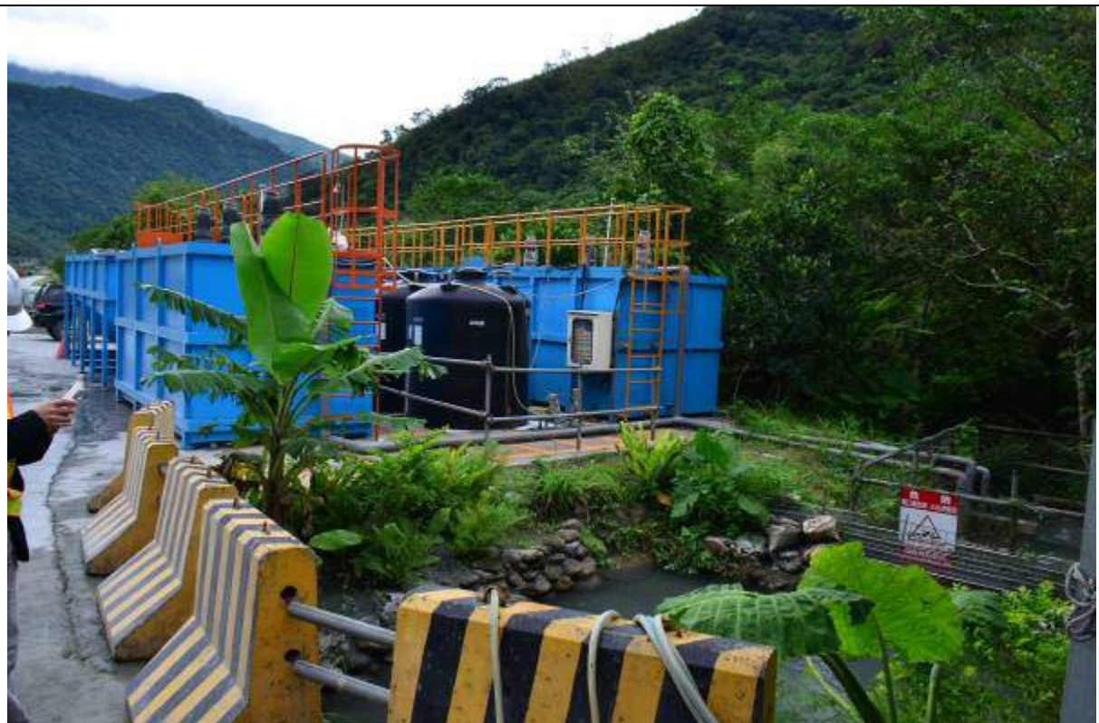
Photo 15 : Mobile water treatment to treat water discharge from tunnel before discharging to river (To confirm effectiveness of water quality management, Koi fishes were put in the holding pond connecting to upstream collected water before discharging to river)