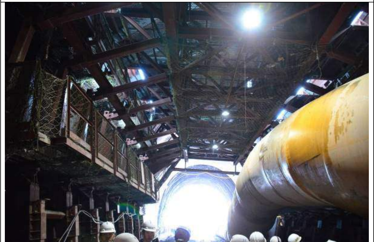
Photo 11 : Mobile steel frame formworks for tunnel lining construction