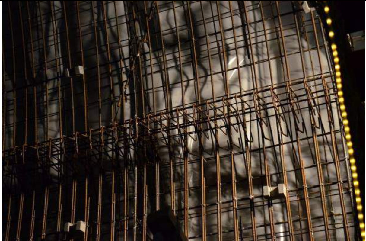
Photo 12 : Reinforcements and water proofing membrane for concrete lining construction