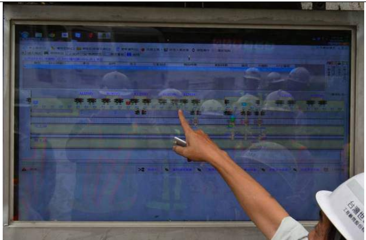
Photo 17 : LCD display at tunnel portal showing locations of workmen and construction vehicles inside the tunnel using RFID