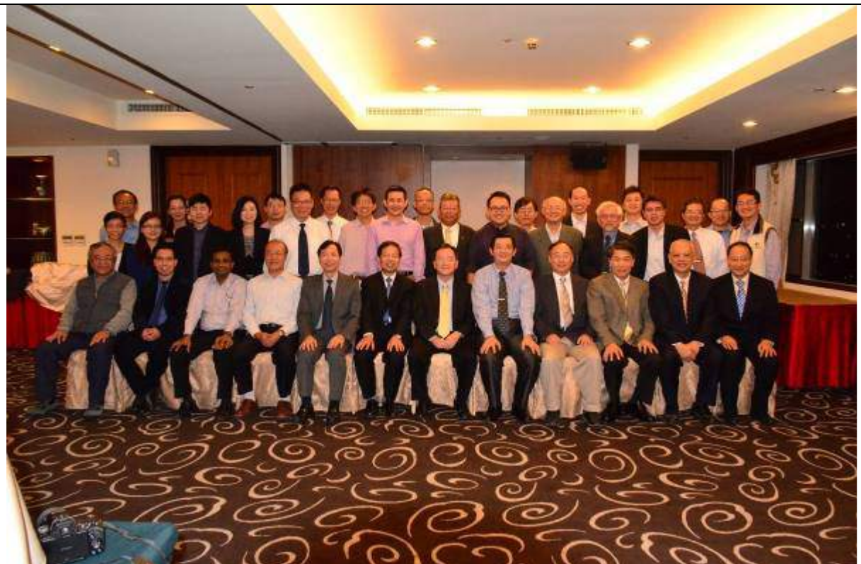
Photo 21 : Group photo of delegates presented at the dinner hosted by Professional Geotechnical Engineers Association of Taiwan on 15 November 2013