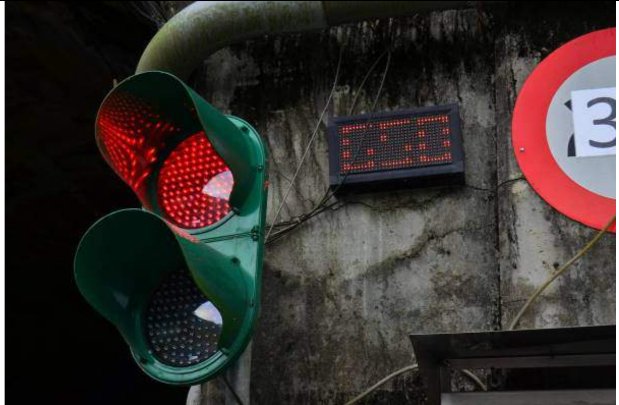
Photo 16 : Traffic signalling with time control using Radio Frequency Identification (RFID) technology for positioning workmen and vehicles inside the tunnel