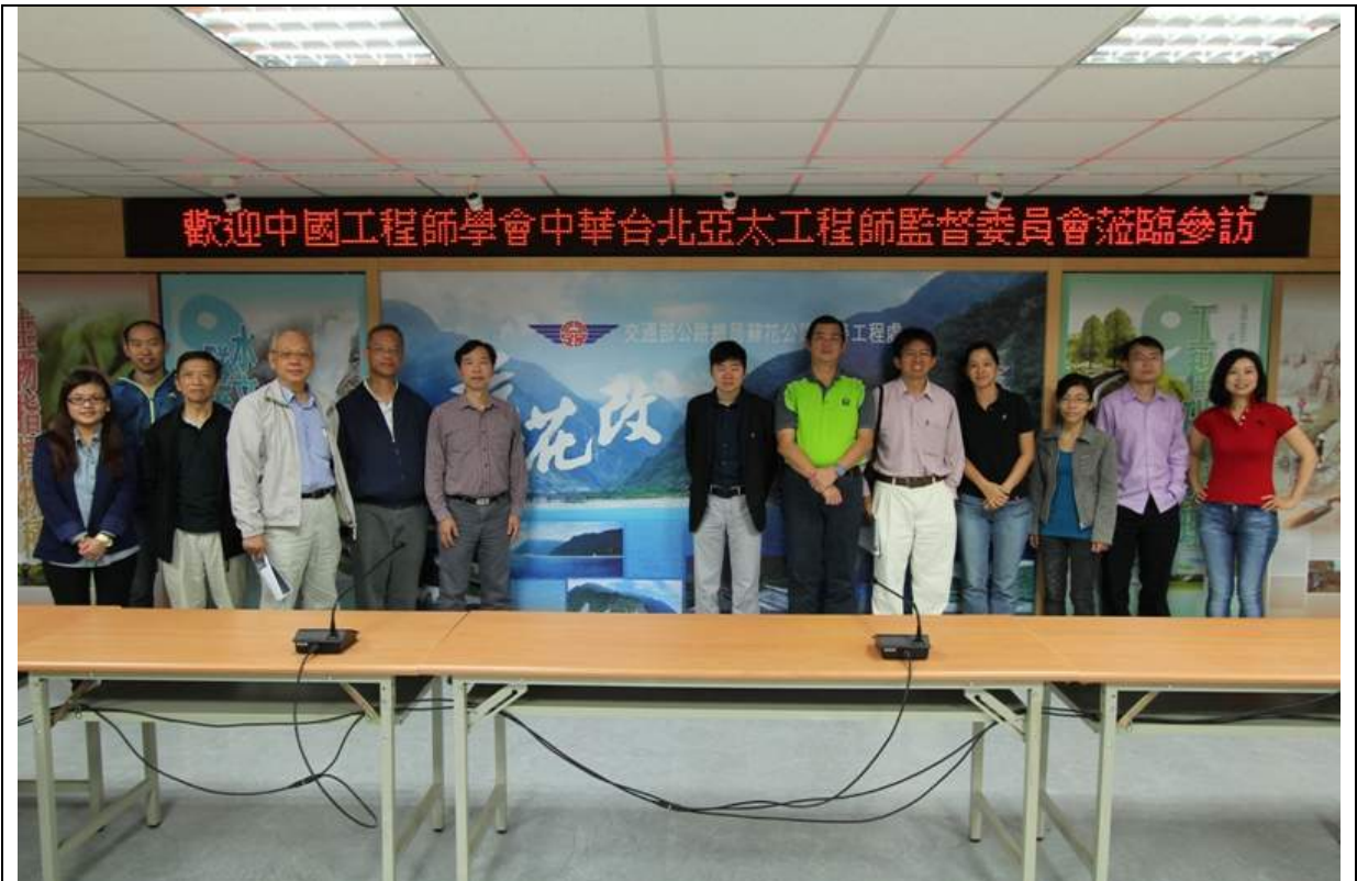
Photo 8 : Group photo at the site visit to The Suhua Highway Mountain Section Improvement Project on 16 November 2013