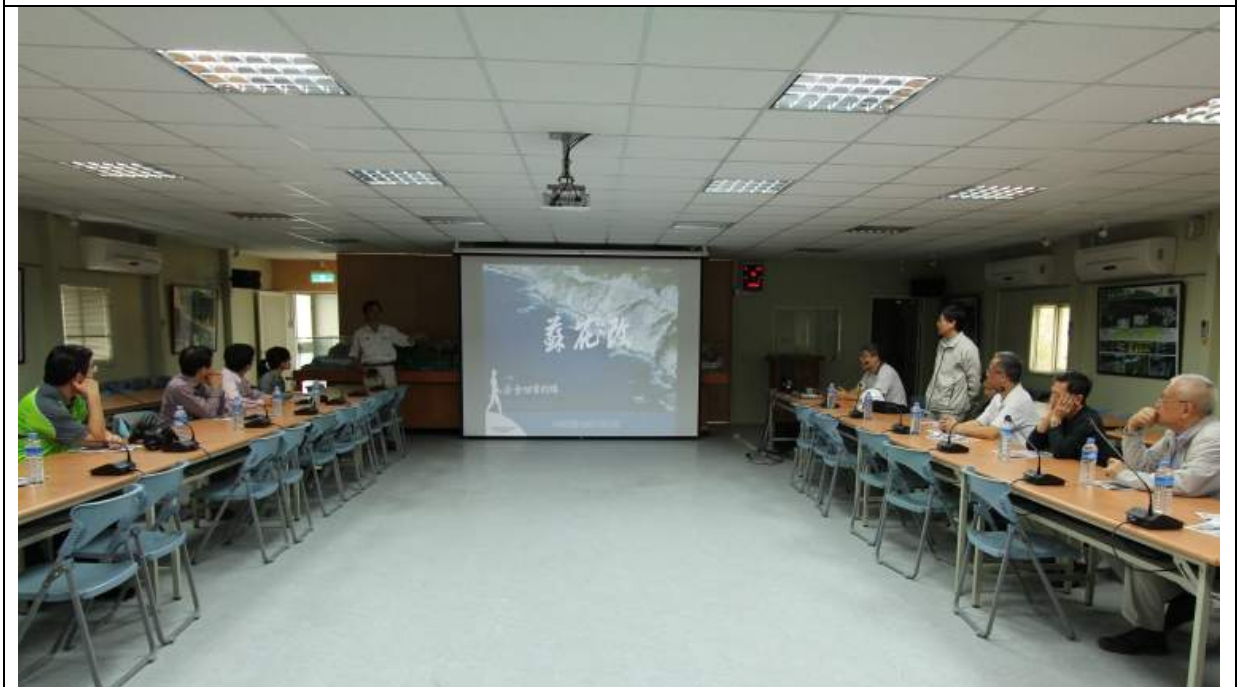
Photo 7 : Technical briefing during site visit to The Suhua Highway Mountain Section Improvement Project on 16 November 2013