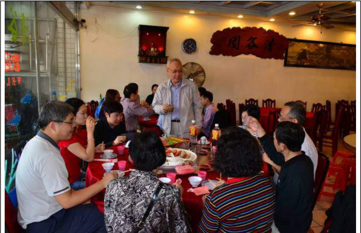
Photo 24 : Seafood lunch organised by the site construction team and CIE to HKIE and IEM delegates