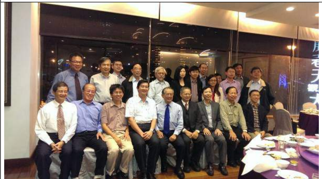
Photo 19 : Group photo after the dinner hosted by Union of Professional Hydraulic Engineer Associations on 14 November 2013