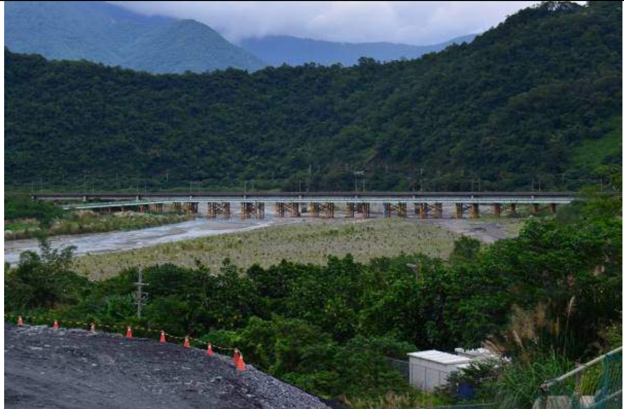
Photo 14 : Temporary steel bridge crossing over stream with primary objective of implementing environmental protection measures