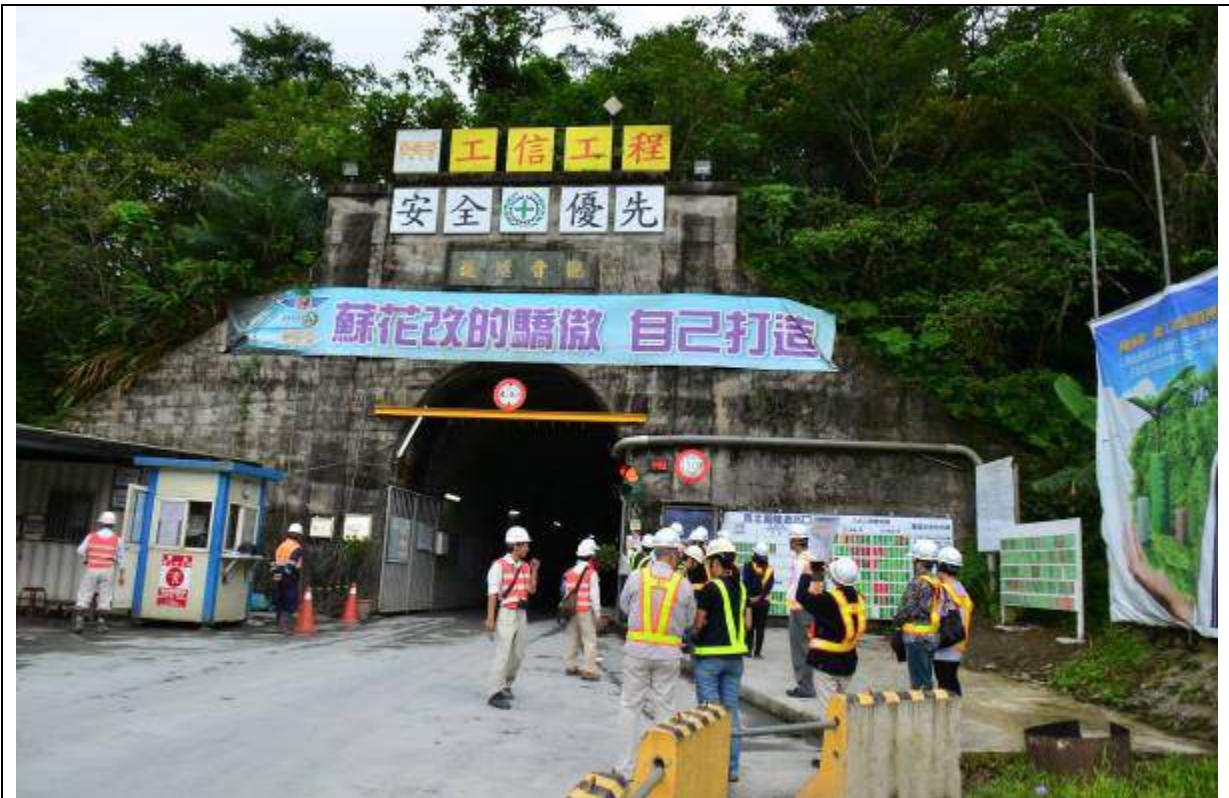
Photo 18 : Overview of tunnel portal with traffic signalling control system and RFID positioning system of workmen and construction vehicles inside tunnel