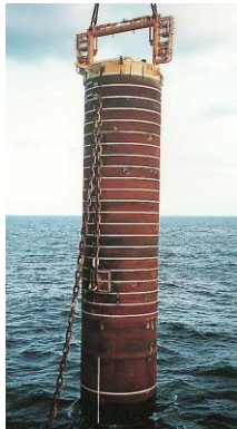
Figure 3: Suction anchor

The speaker moved on with anchors for mooring of offshore floating structures. He introduced various anchors used such as, suction anchors (Figure 3), plate anchors (Figure 4), torpedo anchors (Figure 5) and fluke anchors (Figure 6).