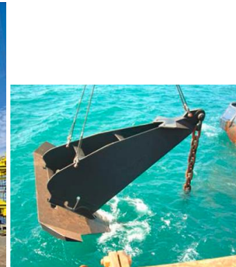
Figure 6: Fluke anchor

A suction anchor is a large diameter cylinder; open-ended at the bottom and closed at the top. The suction anchor is installed by applying under-pressure ('suction') to its interior after it is allowed to penetrate under its own weight. The difference between the hydrostatic water pressure outside the cylinder and the reduced water pressure inside provides a differential pressure that acts as a penetration force in addition to the weight.