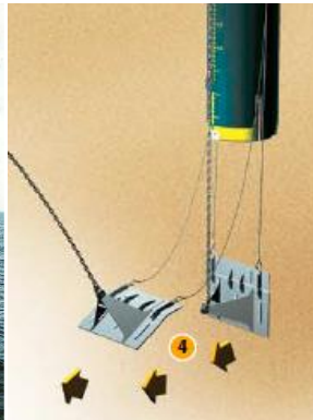
Figure 4: Plate anchor