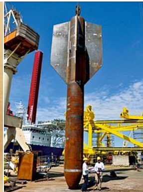
Figure 5: Torpedo anchor