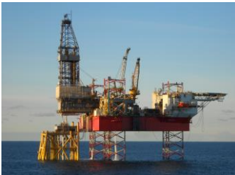
Figure 2: Jack-up platform

The speaker continued on jack-up platforms (Figure 2). The geotechnical considerations for jack-up platforms include spudcan penetration analysis, stiffness of footing and the cyclic effects on foundations. There are various on-going studies at NGI such as, interaction between jack-up spudcan foundation and adjacent piled foundation, and interaction between jack-up spudcan foundation and adjacent pipelines.