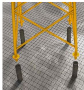
Figure 8: Pre-piling