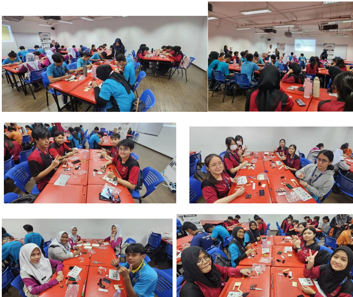
Figure 2: Workshop photos from Session 1 and Session 2.

During the hands-on activity, the students worked individually. They carefully assembled their cars under the supervision of the IEM engineers. The process demanded significant attention to detail: the alignment of the wheels had to be precise to ensure smooth movement, wiring had to be connected correctly to allow proper power flow, and the overall structure of the car needed to be stable enough to withstand motion. The engineers walked from one group to another, offering support whenever students encountered difficulties, particularly in the wiring segments or mechanical balancing.