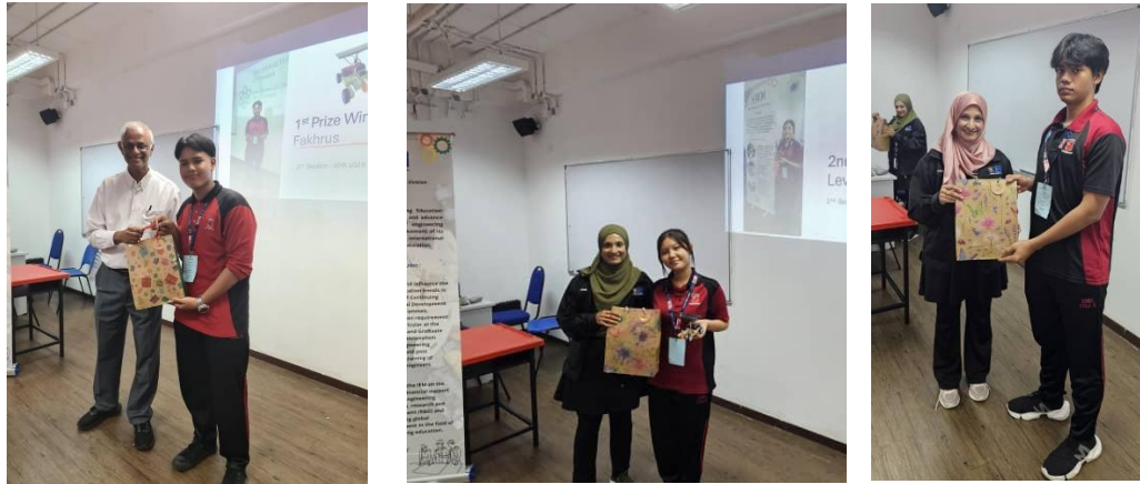
Figure 5: Winners for Session 1