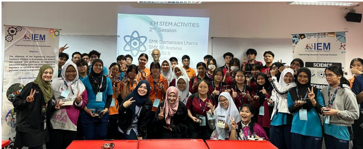
Figure 6: Group photo taken at the end of Session 2.

Across both sessions, the programme successfully delivered a rich educational impact. Students not only learned about renewable energy concepts but also gained hands-on experience with simple circuits and mechanical assembly. Teachers accompanying the students praised the structure of the workshop and appreciated the opportunity for their students to engage with practising engineers. They noted that such experiences can significantly motivate students to pursue STEM-related careers in the future.