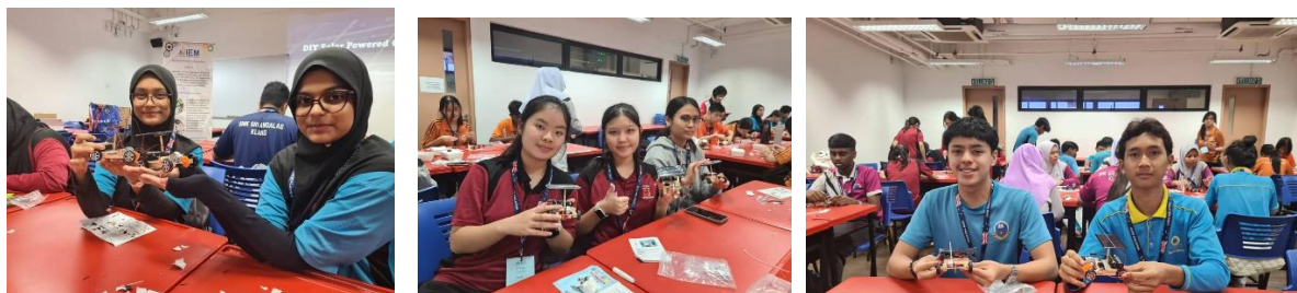
Figure 7: Students with their completed solar-powered car

Across both sessions, the programme successfully delivered a rich educational impact. Students not only learned about renewable energy concepts but also gained hands-on experience with simple circuits and mechanical assembly. Teachers accompanying the students praised the structure of the workshop and appreciated the opportunity for their students to engage with practising engineers. They noted that such experiences can significantly motivate students to pursue STEM-related careers in the future.