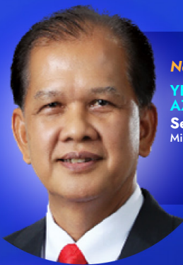
National Spotlight YBHG. DATO' SERI AZMAN IBRAHIM Secretary-General Ministry of Works, Malaysia

9 - 10 SEPTEMBER 2025 KUALA LUMPUR CONVENTION CENTRE (KLCC), MALAYSIA