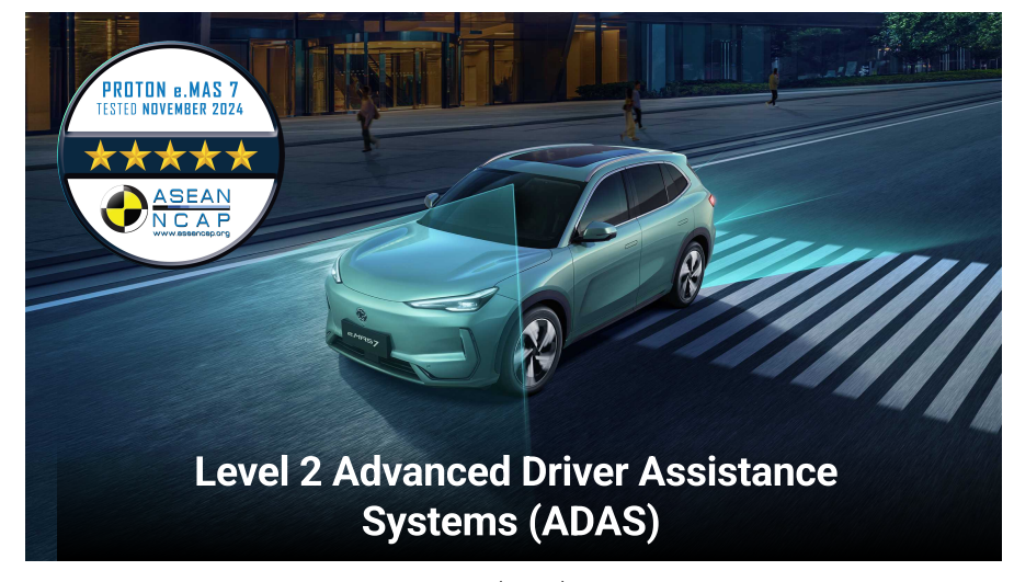
Intelligent Cruise Control (ICC), Automatic Emergency Braking (AEB), Emergency Lane Keep Assist (ELKA) Lane Change Safety Warning (LCW), Traffic Sign Recognition (TSR) and other active safety systems.