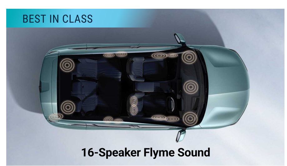
With WANOS System