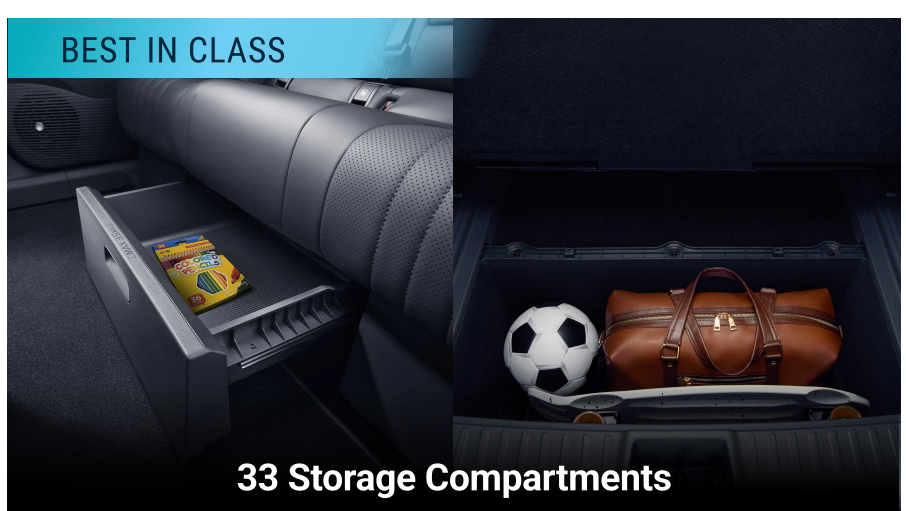
To Keep Things Organised.