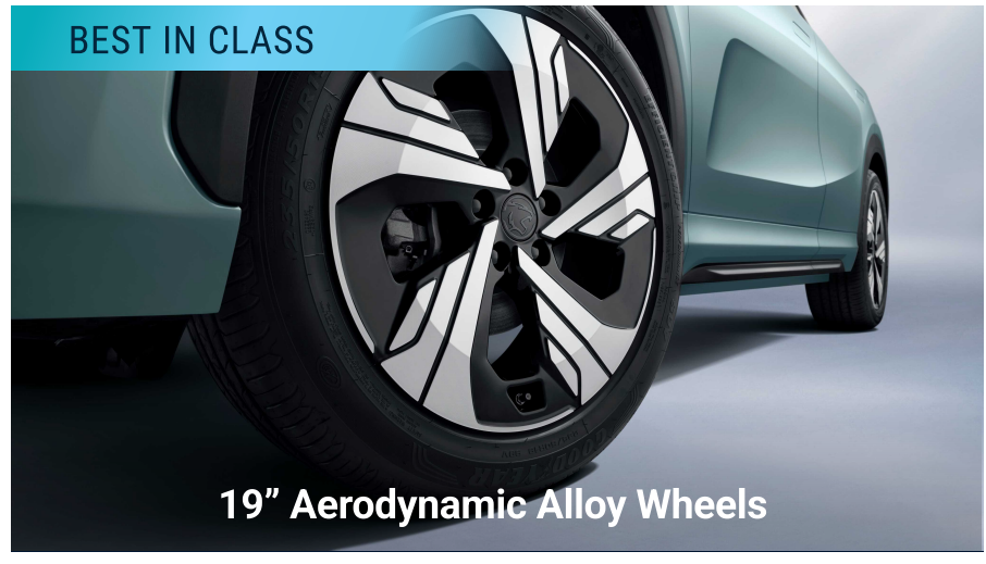
Engineered for performance, style, and a commanding presence.