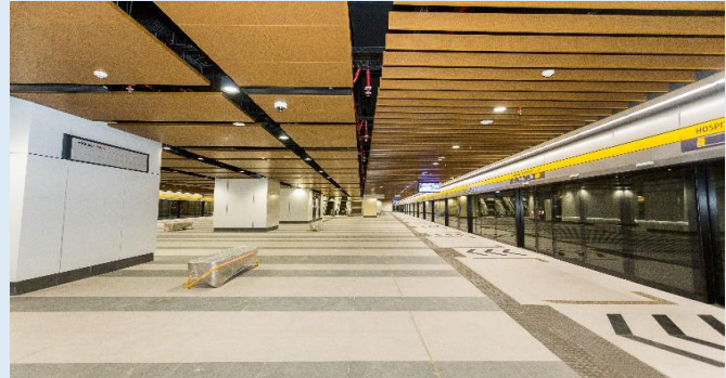
MRT2 HKLS at Platform Level

During the technical visit, participants will get a chance to learn more about one of the new underground stations which is Hospital Kuala Lumpur Station (HKLS). HKLS was built at a depth of 30m from the existing ground level to the base of the station box. HKLS is a MRT station that provides connectivity to both Hospital Kuala Lumpur via Entrance A and Istana Budaya via Entrance B. Through this technical visit participants will be exposed to the design and construction of HKL Station as well as experience the completed station first-hand.