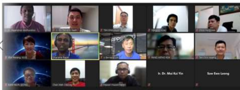
Group Photo of the Technical Talk