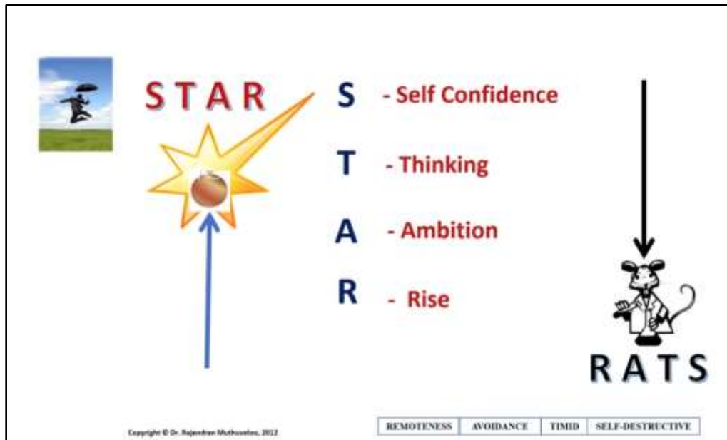
Figure 2.0: STAR vs. RAT

The emphasis and focus on human capital will promote employees to become “STAR” and contribute to the success of the organization and for personal development.