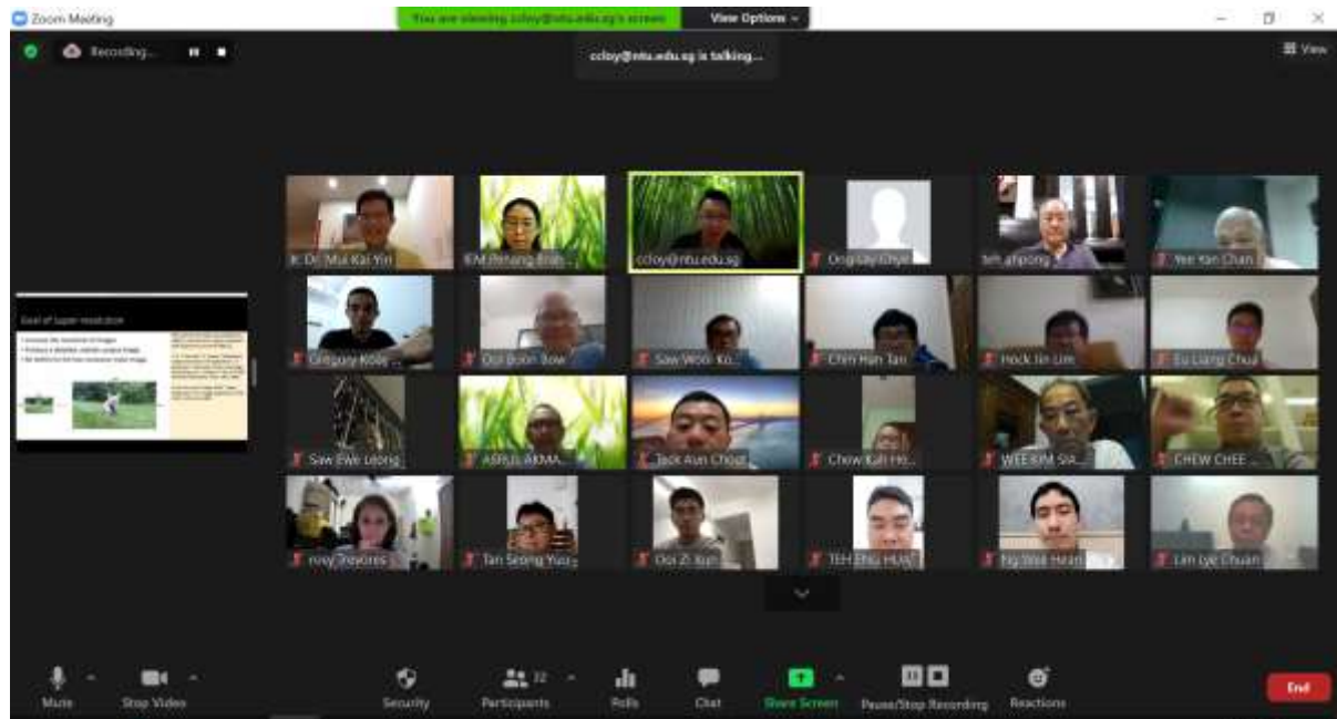
AI Deep Learning: Blurring the Line between Real and the Fake Group Photo

The talk was attended by 33 participants comprises IEM members, and university students and others. A group photograph was taken toward the end of the evening talk.