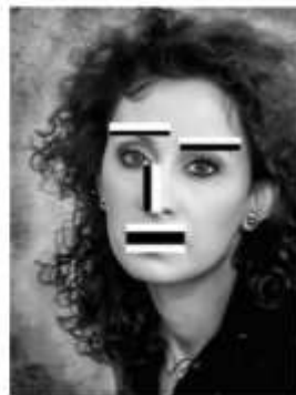
Haar Feature that looks similar to the bridge of the nose is applied onto the face

Viola-Jones detection - a window of the target size is moved over the input image