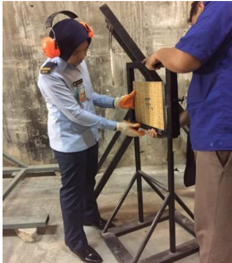
Figure 2: Field testing conducted

Shooting tests were successfully performed in order to determine the ballistic limit (V50) following the military standard of ML-STD-6682, it was discovered that 4:18 WB: WEG was able to withstand the bullet up to 482 m/s, which is more than the minimum speed to qualify for Level of National Institute of Justice (NIJ) IIIA standards. In the case of,9:4:9 WEG: WB:WEG laminated arrangement, the materials only reached level II of the NIJ standards at 414 m/s.