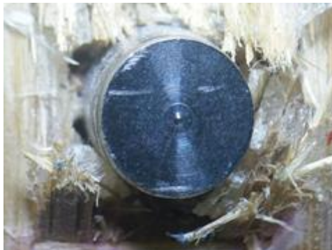
Figure 3: The bullet did not penetrate the laminated woven bamboo/woven E-glass

Shooting tests were successfully performed in order to determine the ballistic limit (V50) following the military standard of ML-STD-6682, it was discovered that 4:18 WB: WEG was able to withstand the bullet up to 482 m/s, which is more than the minimum speed to qualify for Level of National Institute of Justice (NIJ) IIIA standards. In the case of,9:4:9 WEG: WB:WEG laminated arrangement, the materials only reached level II of the NIJ standards at 414 m/s.