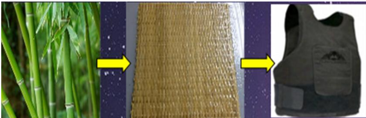
Figure 1: The transformation of bamboo for antiballistic material

On 10th August 2020, Electronic Engineering Technical Division (eETD) conducted an online evening talk on development & fabrication of low to high strength and antiballistic of Malaysian bamboo laminated composites presented by Prof. Dr. Aidy Ali from Universiti Pertahanan Nasional Malaysia (UPNM). The event well was attended by 27 participants. The session started at 6.00pm with short introduction of bamboo as natural fibre with different varieties available and geometries of bamboo specimens. For the project, buluh semantan was selected due to its availability and suitable geometries. Before it can be used as an anti-ballistic composite, the buluh semantan must be cut to a specific dimension and then moulded as laminated strip.