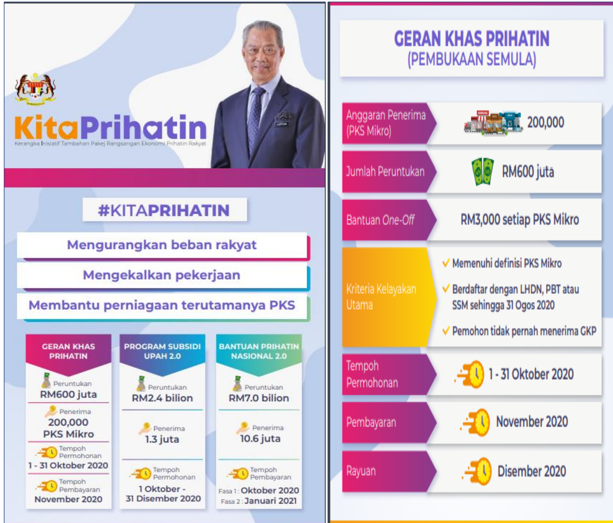
Special PRIHATIN Gran for SMEs (Micro)