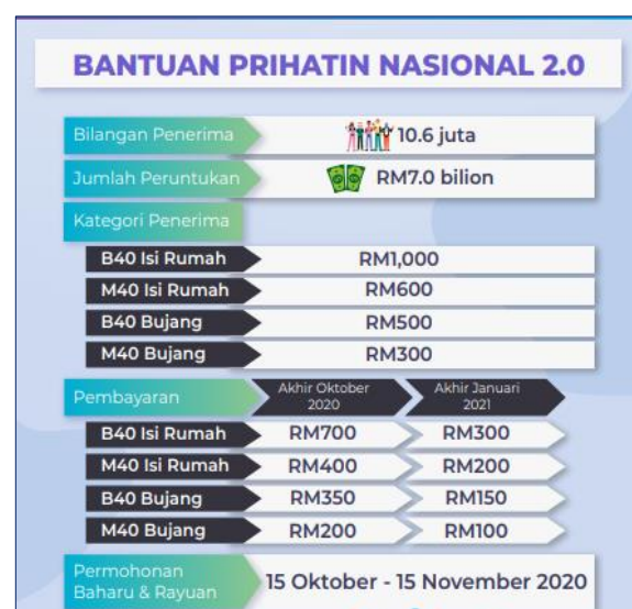
INDIVIDUAL CASH AID