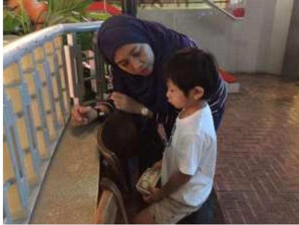
Engineer mummy having an intimate time.

As a budding female engineering student that will be graduating soon, I wish to have a good work life balance where I can spend quality time with my family, at the same time being able to contribute to the economy and the development of our country, Malaysia. It was relieving that in a male dominated profession, WES thought outside the boundary and provided such a wonderful platform for activities that supports women engineers to be successful in not only with their careers, but also with their family development! It was a privilege for me as a university student to work closely with the WES team, assisting them in their activities and also observing their meetings. Working with WES has also given me the opportunity to build my network not only among other women engineers, but also amongst the male engineers in industry.