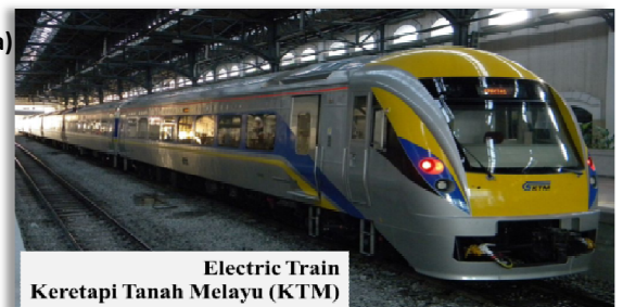
Electric Train Keretapi Tanah Melayu (KTM)