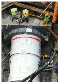
Figure 5: Pipejacking is one of the most common methods of tunnelling in Malaysia