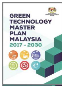
Figure 6: Green Technology Master Plan