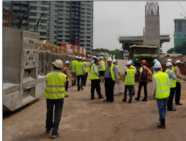
Figure 5a & 5b - Interchange Near Wangsa Maju

Our hosts, Ekovest then treated the participants to lunch, meanwhile being a Friday and during the month of Ramadhan, our Muslim participants went for prayers. Our coach left Ekovest office for IEM at 2:30 pm.