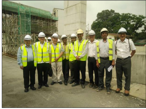
Figure 4a & 4b - Interchange at Jalan Ampang

The construction, involved the use of contiguous bored piles as permanent retaining walls, without sheet piling, for quick construction. As with other urban construction projects, fast construction is essential, as the travel delays caused by construction will cause the construction to lose its benefits. Similar contiguous bored pile techniques as retaining walls were also used at other locations near the Wangsa Maju interchange.