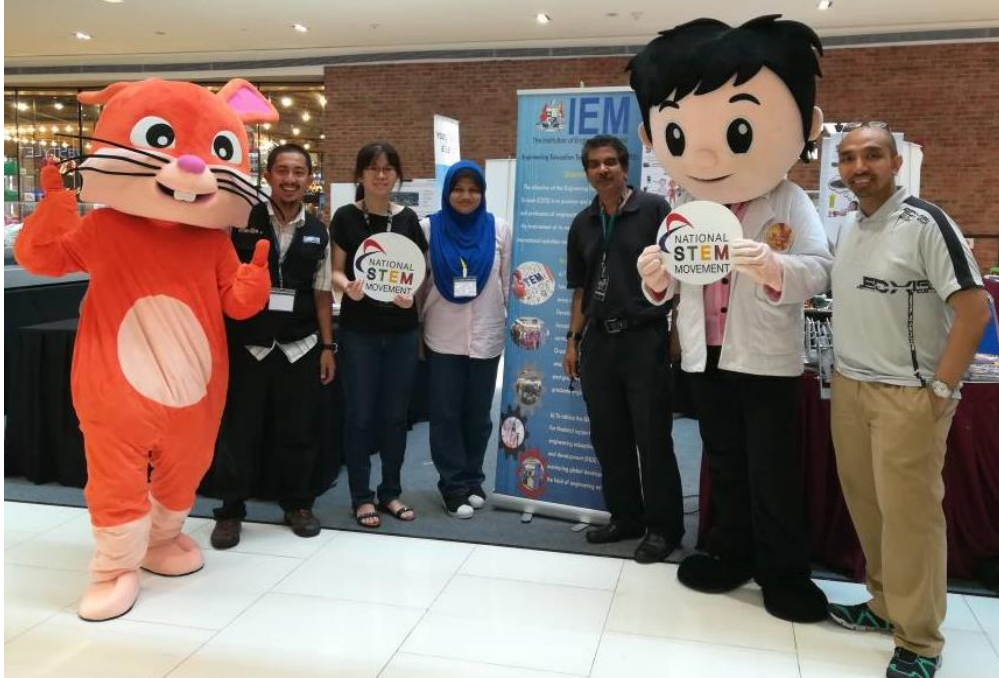
The Official Mascots visited IEM booth with Heriot Watt Staff and Student