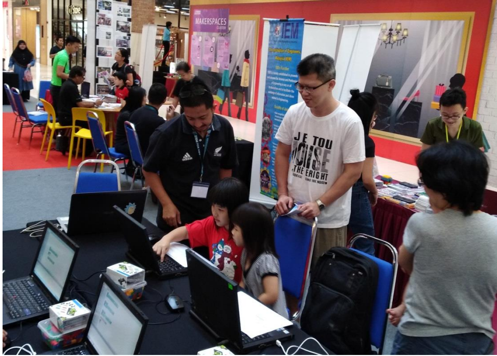
Even children at very young age did hands on activity in IEM workshop