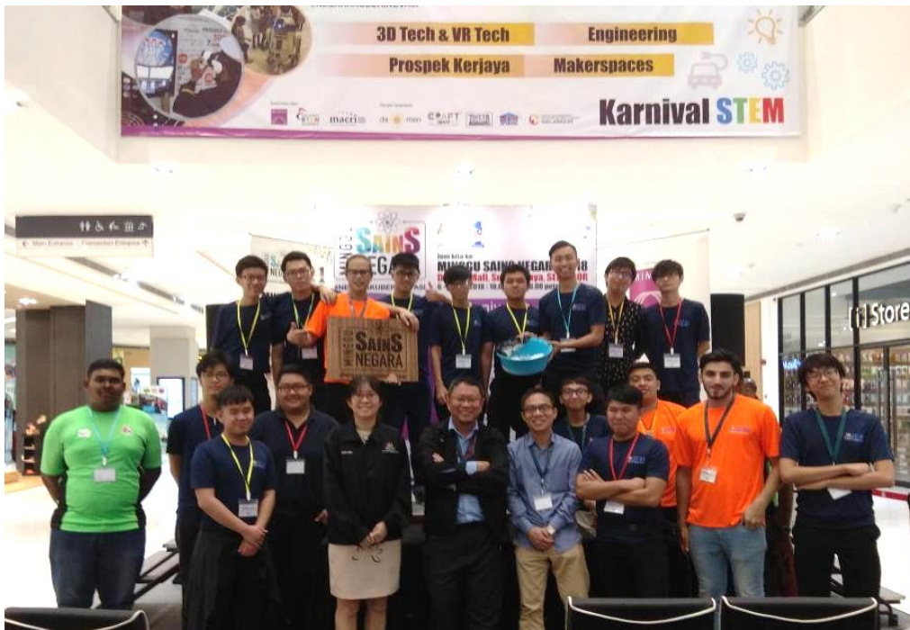
Students from TARUC and Nilai University