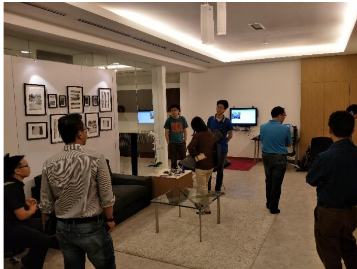
Figure 4: At the MMU Digital Home Lab

After that, the participants dropped by at the Digital Home Lab for an exposure to the integration of IoT into a living space as shown in Figure 4.