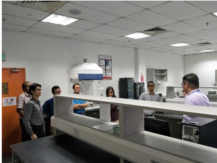
Figure 5: The stop at Nanotechnology Lab