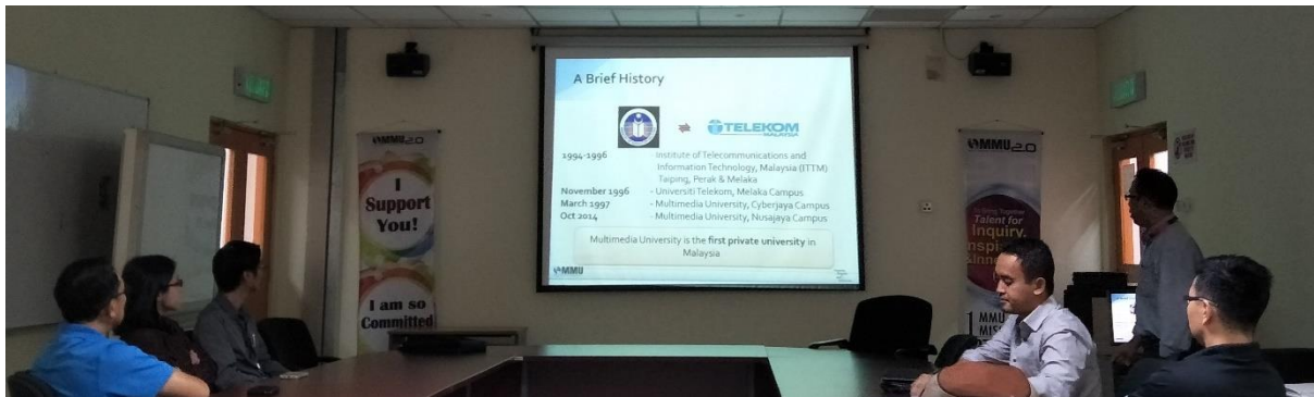
Figure 1: Introduction to FOE MMU