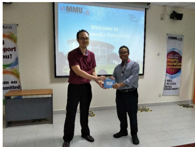
Figure 2: Presentation of Token of Appreciation by IEM EETD to FOE MMU