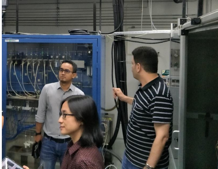
Figure 7: A stop at MCVD lab

The visit concluded with a lunch held at the lobby area of FOE MMU.