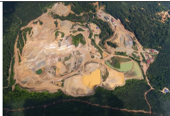
Mine site aerial view