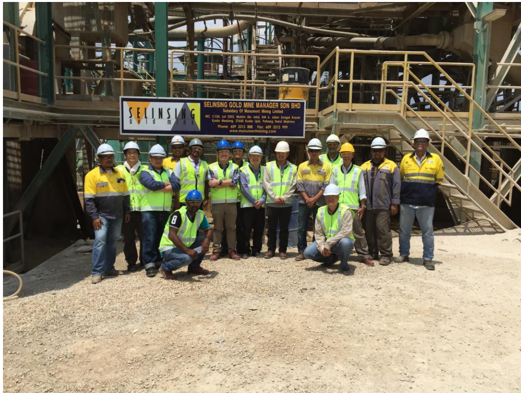
IEM Participants with SGMMSB management

At the end of the tour, the group headed back to the main building. The IEM members were treated to a good lunch at the SGMMSB canteen where they took the opportunity to ask more questions about the gold mining operation and its challenges. The visit ended after lunch with exchange token of appreciation between IEM and SGMMSB management. Overall, it was another successful activity for the OGMTD, and definitely another trip will be organized again in 2016.