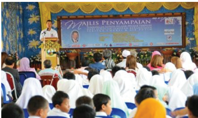
Y. Bhg. Dato' Ahmad Shabery giving his speech