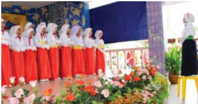
Entertainment from the young ladies