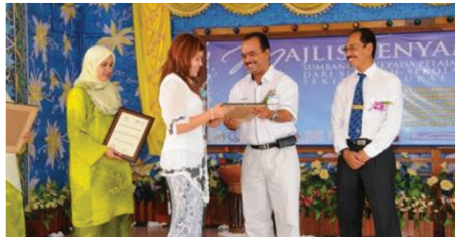
The presentation of token of appreciation to the donors