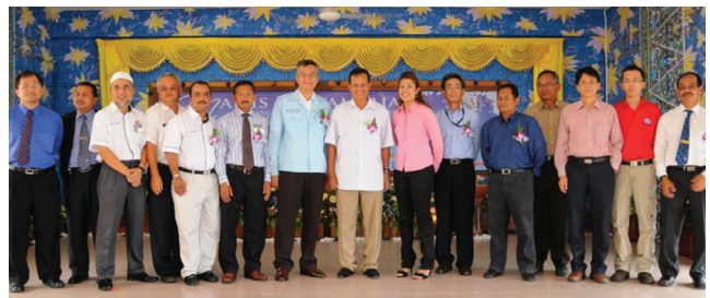
Group photo of IEM Kerteh Chapter Committee Members and the Honourable Minister

One of the school teachers mentioned that due to the severe monsoon in this area, the parents of these children, who are mainly fishermen and farmers, do not have regular