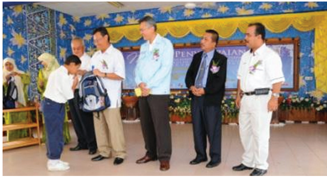
Smiling faces receiving school bags